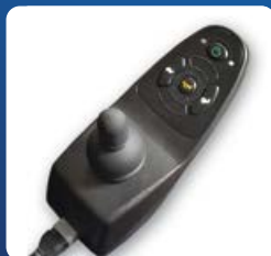
Dynamic Shark Controller

The Jazzy® Elite HD 1 features two-motor, front-wheel drive technology and heavy-duty construction. The Jazzy Elite HD features 14" drive wheels for enhanced outdoor performance combined with a front-wheel drive design to provide tight turns for optimal indoor maneuverability in small spaces. Large front wheels add extra absorption for superb climbing capabilities and combine with front anti-tip wheels for handling various terrains with ease.