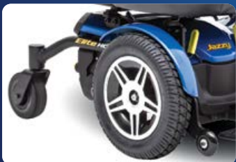
Front-wheel drive design