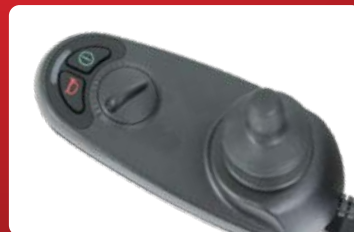
PG GC3 controller

The Jazzy Select® 61 incorporates sporty design and performance features for a truly unique ride experience. Pride's patented Active-Trac® Suspension combined with six wheels on the ground and an innovative articulating beam allow for superior performance indoors and out, with added stability over uneven terrain and ramp transitions.