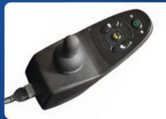
50A, dynamic shark controller

Power and precision combine into one exceptional power chair! The Jazzy ® 614 HD 1 features outstanding suspension and a tight turning radius. Large drive wheels and six-inch casters tackle uneven terrain, no matter where your day takes you.