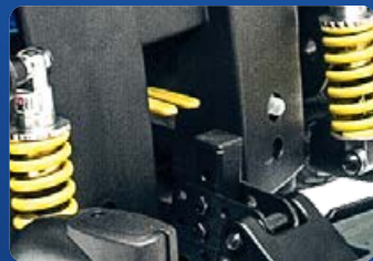
Easy-access freewheel levers