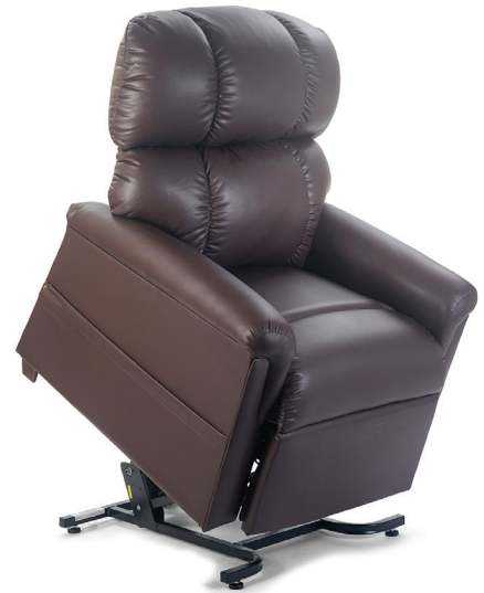
PR535M shown in Brisa Coffee Bean