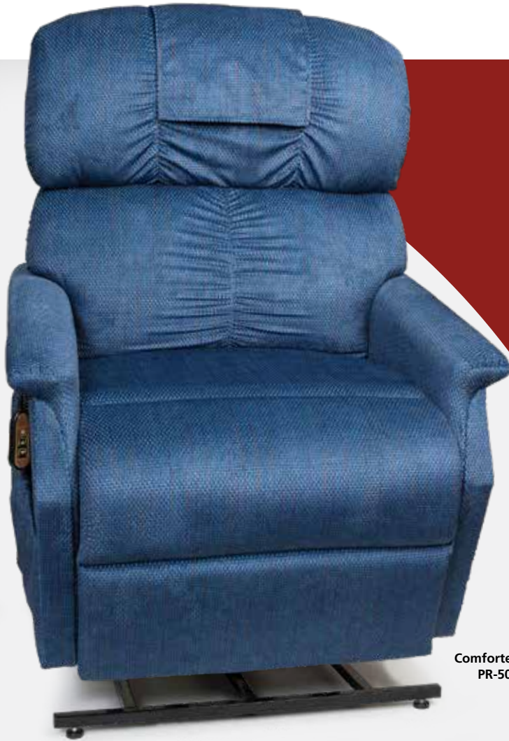
Comforter Tall Wide PR-501T-28D