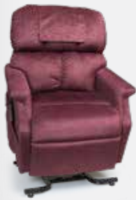
Comforter Small Wide PR-501S-23