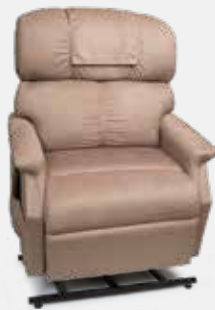
Comforter Medium Wide PR-501M-26D