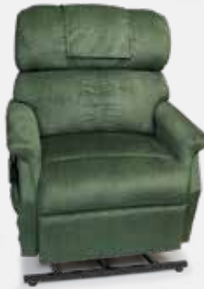
Comforter Large Wide PR-501L-26D