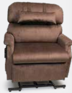
Comforter Super 33 Wide PR-502