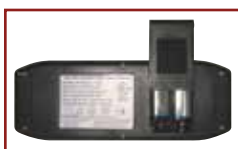
Battery Backup System

Sizes may vary depending on fabric, filling material, upholstery and carpet thickness. All measurements taken on concrete floor using levels and metal rulers.