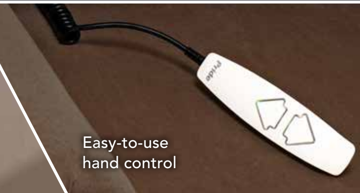
Easy-to-use hand control

ENERGY EFFICIENT WITH BUILT-IN BATTERY BACKUP