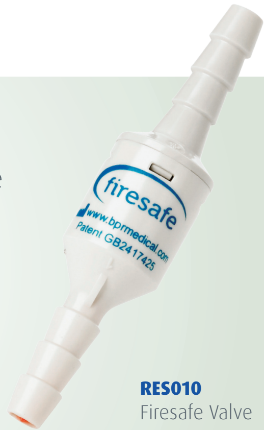
RES010 Firesafe Valve