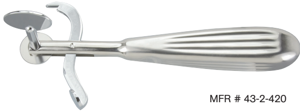
MFR # 43-2-420