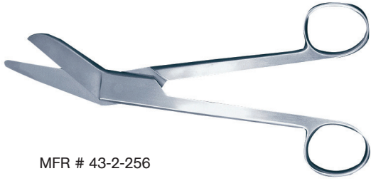
MFR # 43-2-256