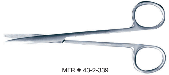
MFR # 43-2-339