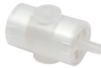
RES027OP T-HME with Oxygen Port