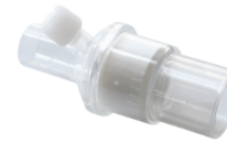
RES027ILO Inline HME — Large Volume with Oxygen Port