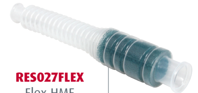
RES027FLEX Flex HME